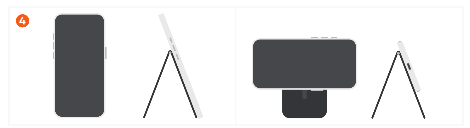
You can use the wallet as a stand in portrait and landscape layout.