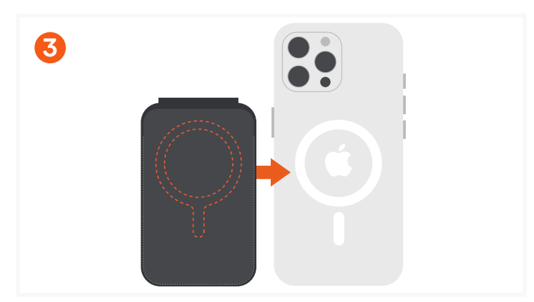
Align and attach the wallet to the rear of the phone. Compatible with iPhone 12-16. Not compatible with iPhone 12/13 mini.