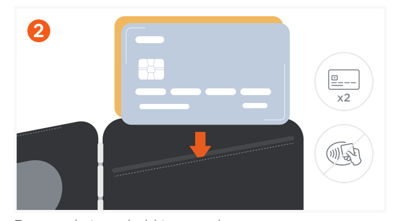
Rear pocket can hold two cards max.

Front pocket can hold 2 cards and contains an ID window. Supports tap to pay and NFC. Recommended to insert the card using NFC in the front of the pocket and ID in the back. Not recommend to use more than one tap to pay card in the front pocket.