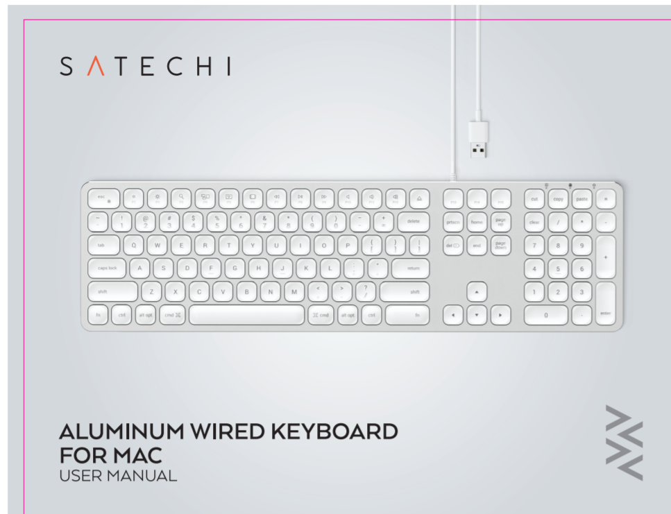
ALUMINUM WIRED KEYBOARD FOR MAC USER MANUAL